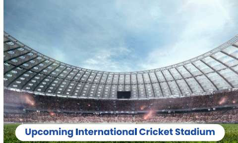
Upcoming International Cricket Stadium