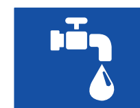
Fresh Water Supply