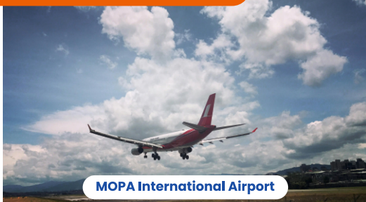
MOPA International Airport

#Any other charges/ taxes levied by the Govt. will be charged as per Extra.